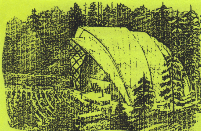
... Rendering of proposed new Malkin Bowl ...