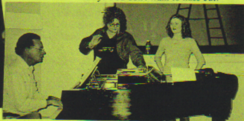
Rehearsals: "King" (left) and "Anne of GG" above ....

We'll speed your membership card to you so you can validate your free ticket to Opening Night of either show. Hurry! You don't want to miss out!